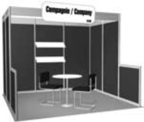
Package B-1 (10' x 10')