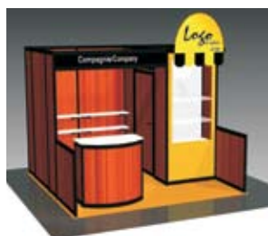
Model 2 (10' x 10') Back shelf optional