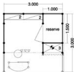
From top (10' x 10')