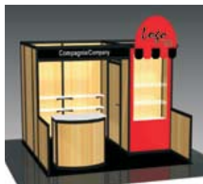
Model 1 (10' x 10')