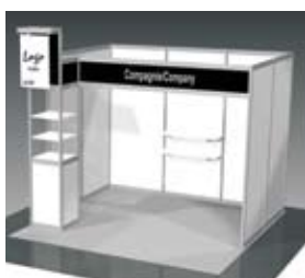
Model 10' x 10'