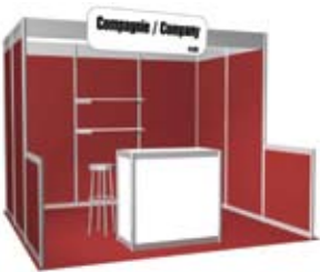
Package B-2 (10' x 10')